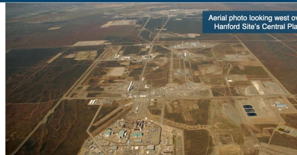
Aerial photo looking west over the Hanford Site's Central Plateau

The Tri-Party Agreement (TPA) agencies — U.S. Department of Energy (DOE), U.S. Environmental Protection Agency (EPA) and Washington State Department of Ecology (Ecology) — have agreed to pilot a new approach to establishing Hanford cleanup milestones. As the new approach will involve some changes to the TPA and established milestones, the agencies would like your input on it.